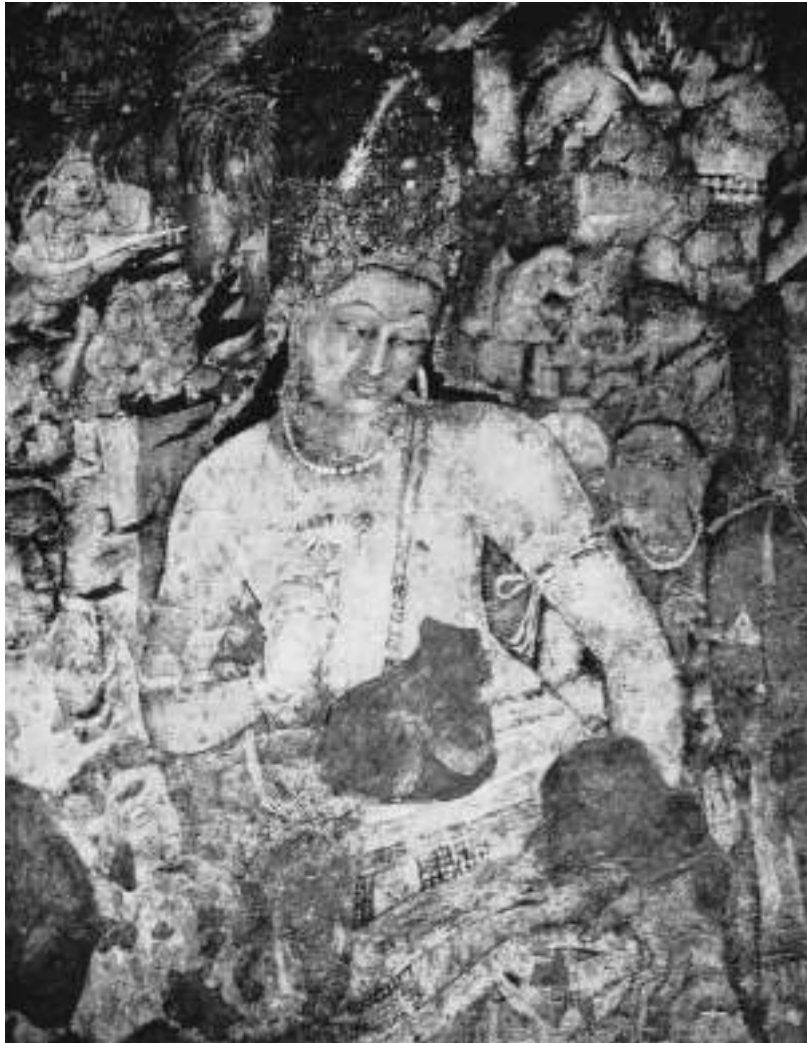
Painting: Cave I, Ajanta Caves, Maharashtra