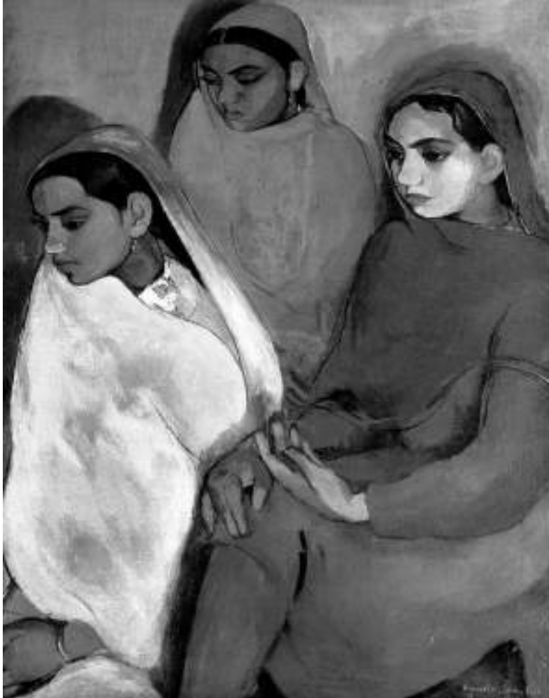
Painting: 'Three Women' by Amrita Shergil