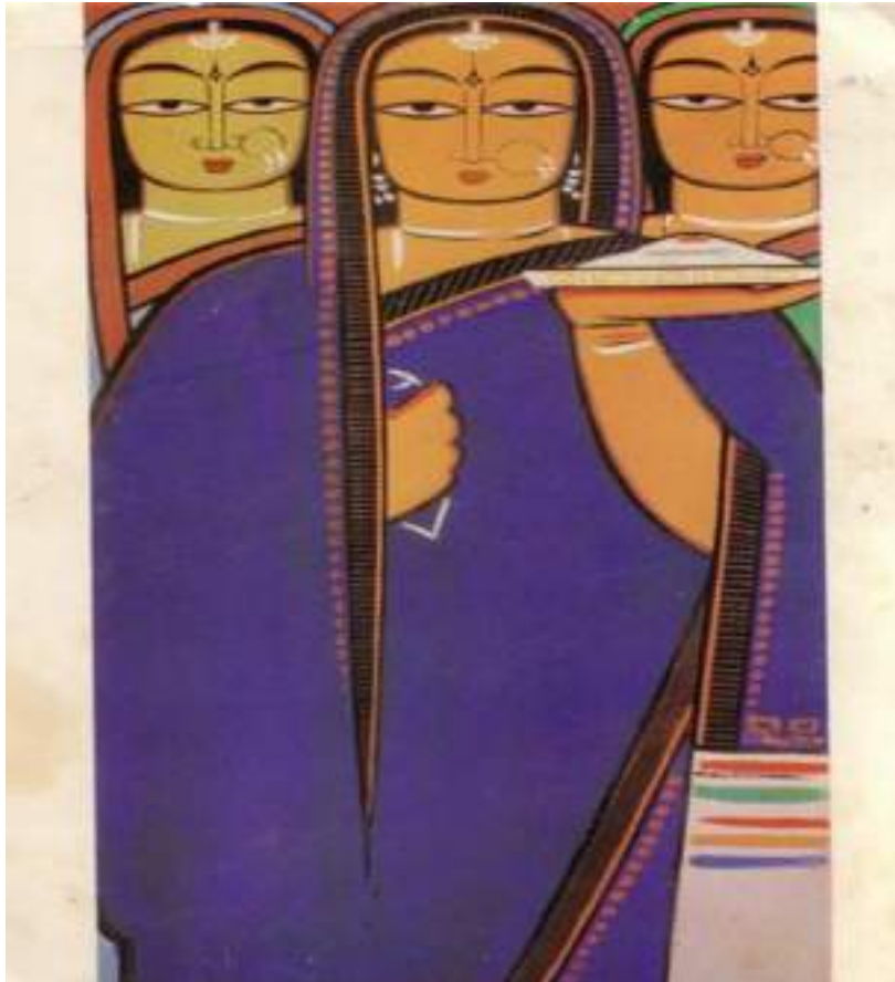
Painting: 'Pujarinis' by Jamini Roy