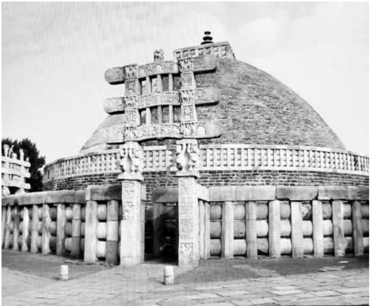
Sanchi Stup, Madhya Pradesh

The stupas at Bharhut, Sanchi, and Bodh Gaya in the north, and at Amravati and Nagarjunakonda in the south, are renowned for their elaborate carvings, which depict Buddhist symbols and stories in low relief. The Sanchi Stupa, with a diameter of 120 feet and a height of 54 feet, exemplifies these features.