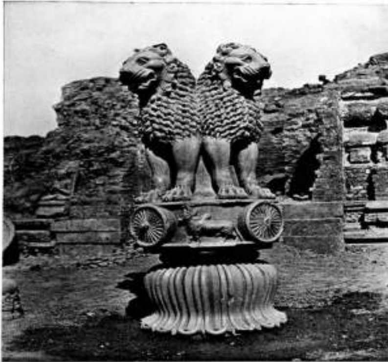
Lion Capital from Ashoka Stambha, Stone, Sarnath, Uttar Pradesh