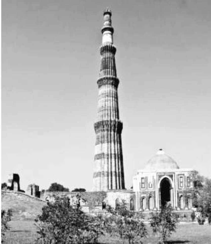
The Qutub Minar in Delhi