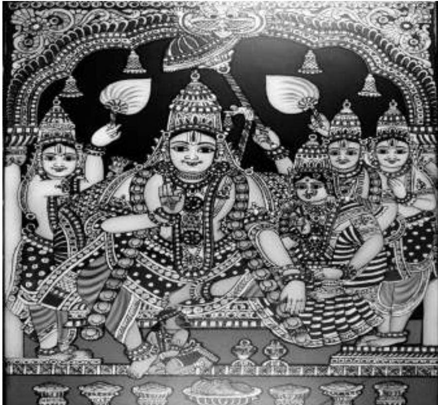
Rama's coronation Tanjore Painting