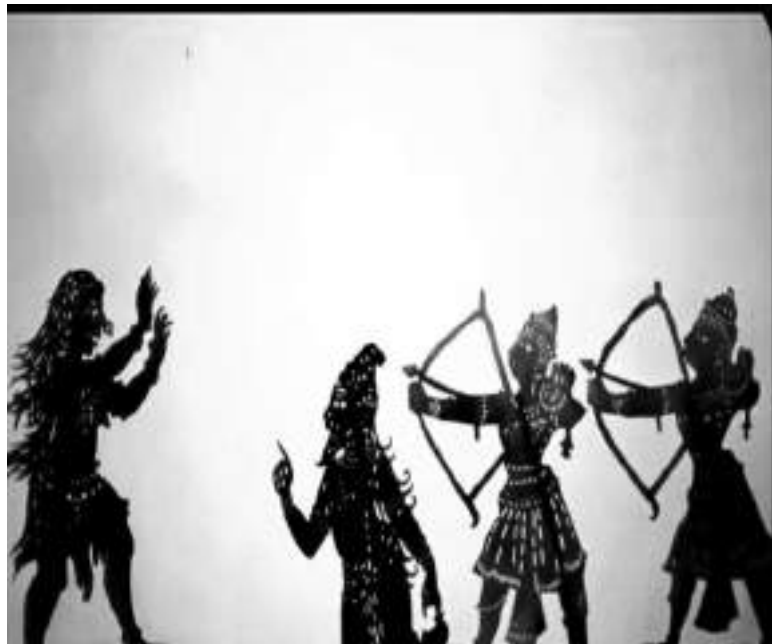
Tholu Bommalata, Andhra Pradesh