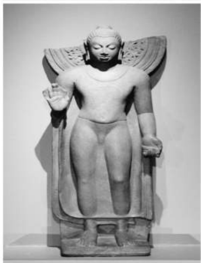
Standing Buddha, Sarnath, Uttar Pradesh