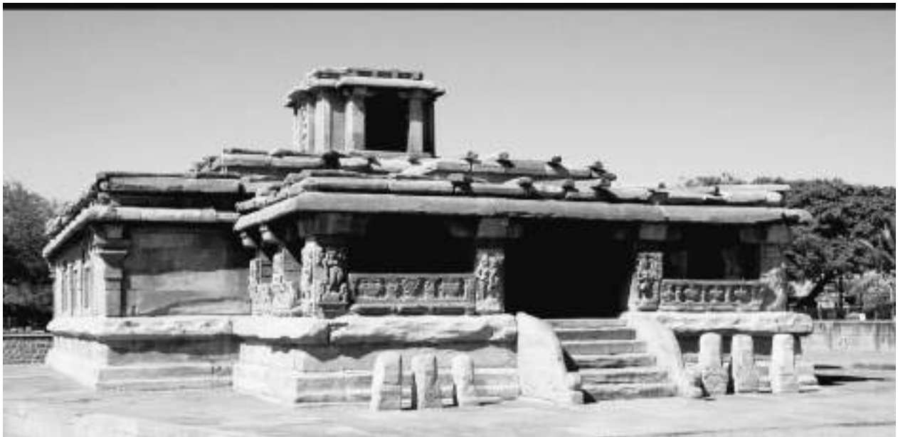
The Ladkhan Temple in Aihole, Karnataka

Another notable temple, the Nakula and Sahadeva Temple at Mahabalipuram, is apsidal with ornamental features and lacks figure-carvings, showcasing the architectural experimentation of the time.